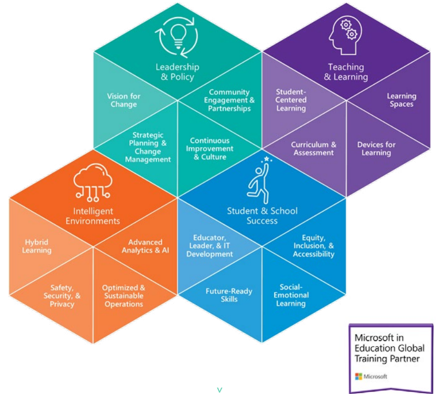
Microsoft Education Transformation Framework